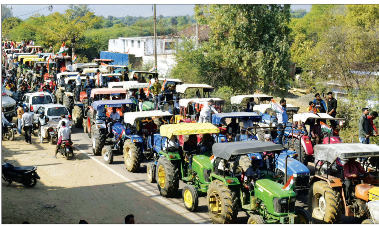
Congress workers with farmers stage a tractor rally to protest against the farm laws at Patan Tehsil, in Jabalpur on Saturday.

NEW DELHI: The Centre said on Saturday that around 55 per cent of health care workers have been vaccinated in the country so far whereas nearly 5 per cent of frontline workers have received the Covid vaccine till date.