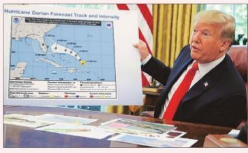
President Donald Trump talks with reporters after receiving a briefing on Hurricane Dorian in the Oval Office of the White House on Wednesday in Washington.

THE ASSOCIATED PRESS New York, September 6